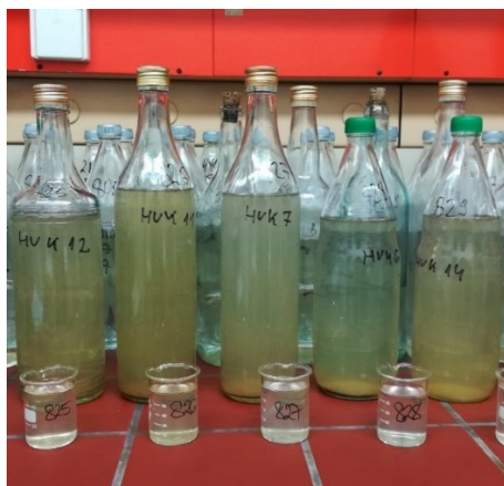
Figure 2. River water samples from the selected locations in north-west Croatia.

Sampling was performed according to the water sampling regulation ISO 5667-6 „Guidance on sampling of rivers and streams“ (5667-6 ISO). Sampling was performed manually, about 15 cm beneath the water surface, and the sample was collected directly into the 1000 ml sampling glass bottles with the bottleneck turned to the water stream (Figure 2). At each location one sample was taken. The samples were stored at 4 °C and transferred to the laboratory. Next, the samples were filtrated through 0.45 µm filter paper and the filtrate was transferred to the 50 ml plastic bottles, and ready for measurements. Measuring the dissolved fraction of metals has allowed us to estimate the quantities of the bioavailable heavy metals.